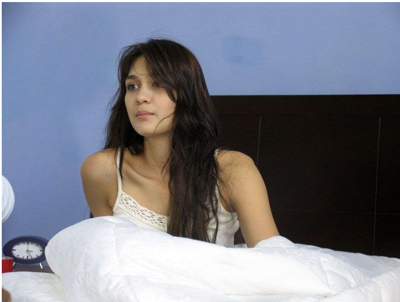
(2011) Seks Luna Maya Dan Ariel Peterpan